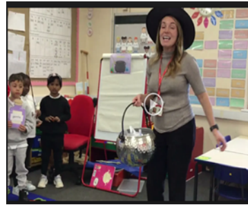
Year 1 creating a friendship potion poem!